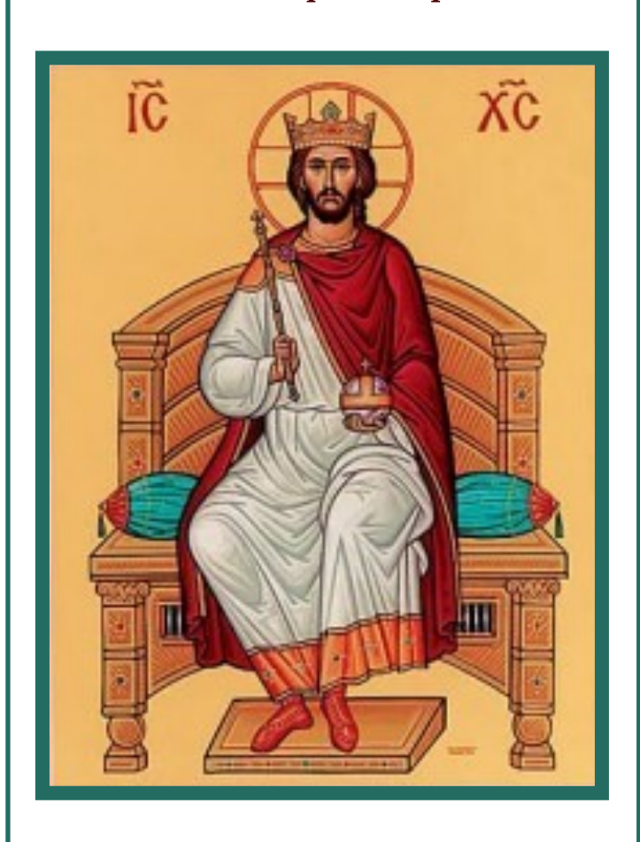
Sunday of Christ The King